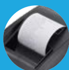
76mm printing width