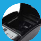
Large capacity paper bin

Compatible with ESC/POS print instruction set, printing density optional