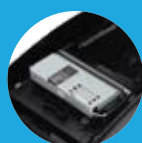
Wear-resistant print head